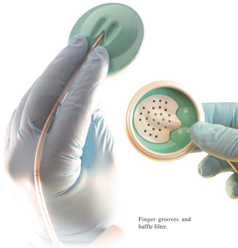
Finger grooves and baffle filter.

Kiwi is the trademark of Clinical Innovations, Inc